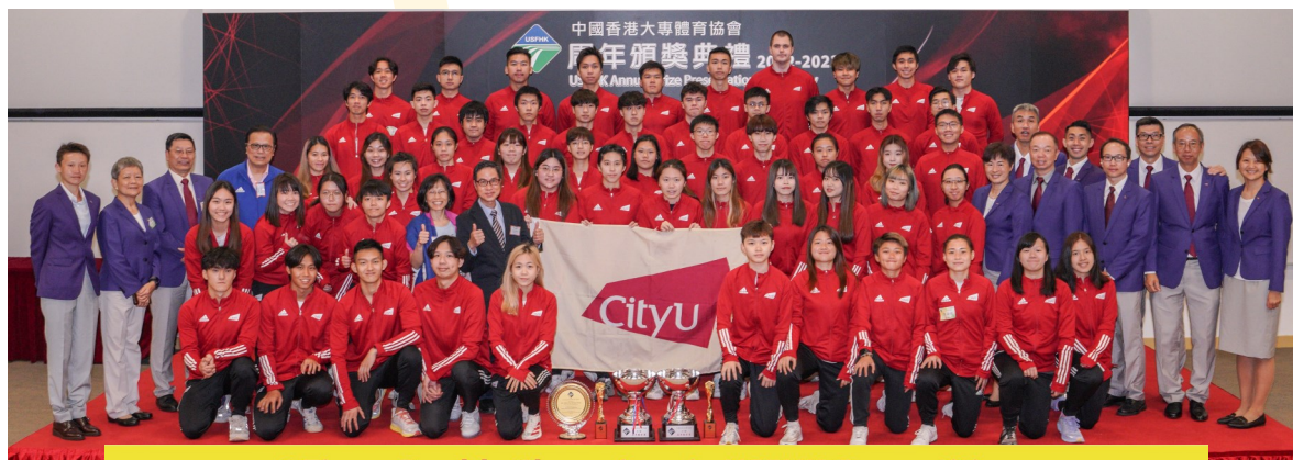
9 Times Double Champions in USFHK Competitions 96-97, 00-01, 07-08, 08-09, 09-10, 10-11, 12-13, 13-14, 16-17

With professional training and dedicated team efforts, CityUHK has become one of the leading universities in sports among local tertiary institutions in Hong Kong.